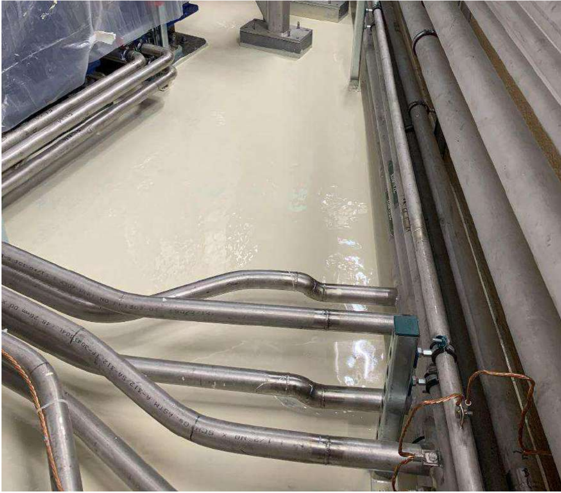
Application of Souplethane 5N in nuclear industry