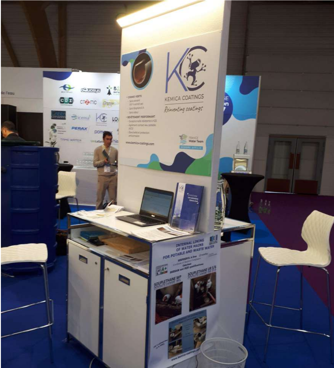
Carrefour des gestions locales de l'eau, January 29th