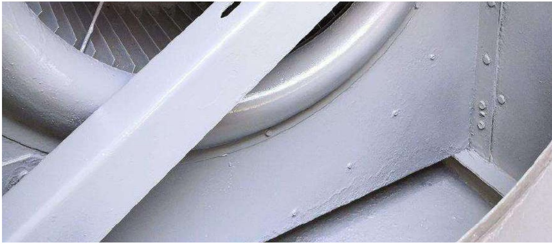
Coating of a ventilation box, SILTHEK