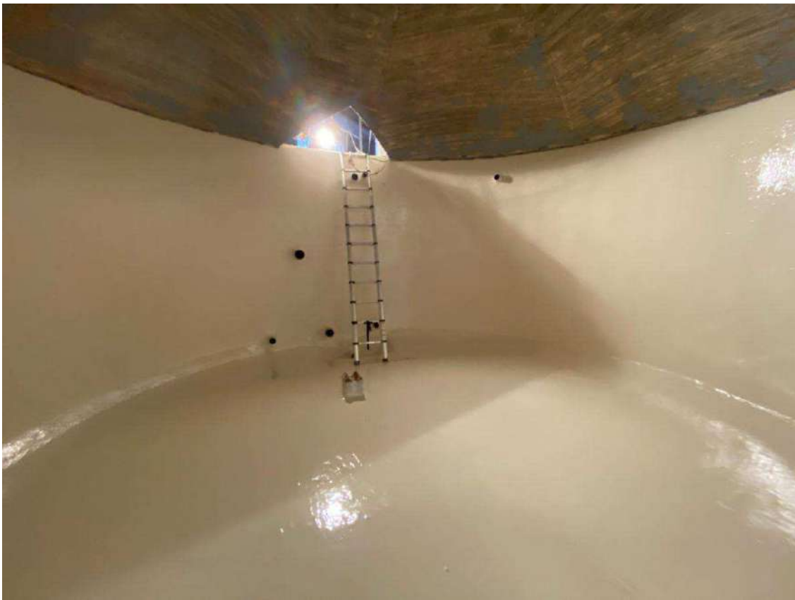
Waterproofing of a potable water tank with SOUPLETHANE WP